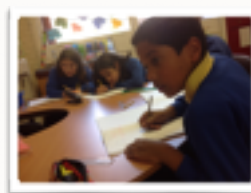
Additional support in the classroom

We used Pupil Premium money to enhance our curriculum too. We pay for a peripatetic music teacher to teach instruments. Staff attended training to prepare for the new curriculum. Software and hardware were also purchased to support those without access to resources at home.