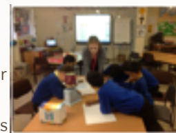
Additional tutoring in Maths and English

We currently employ one teaching assistant for every class. Every morning teaching assistants work with small groups in Read, Write, Inc and Fresh Start to improve phonics and writing. HLTAs also deliver small group maths lessons for children who need more focused support, whether Gifted and Talented or SEN. The teaching assistants also provided additional intervention work before and after school using Numbers Count 1 and 2, and deliver lunchtime intervention in reading and writing. We recruited an EAL specialist to promote academic achievement for our growing number of students for whom English is an additional language (59%).