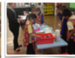
After school clubs