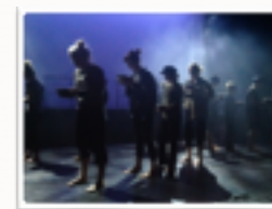
External visiting companies

Last year we supplemented two residential trips for Years 5 & 6. We also used the money to pay for visiting theatre companies like 'M&M Productions' and companies like 'Play in a Day' for children to produce their own dramas like Romeo and Juliet. The minibus enables us to travel to wider destinations cost effectively and this summer we took the whole school to the beach.