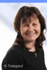
Mrs Curry Nursery Nursery Nurse